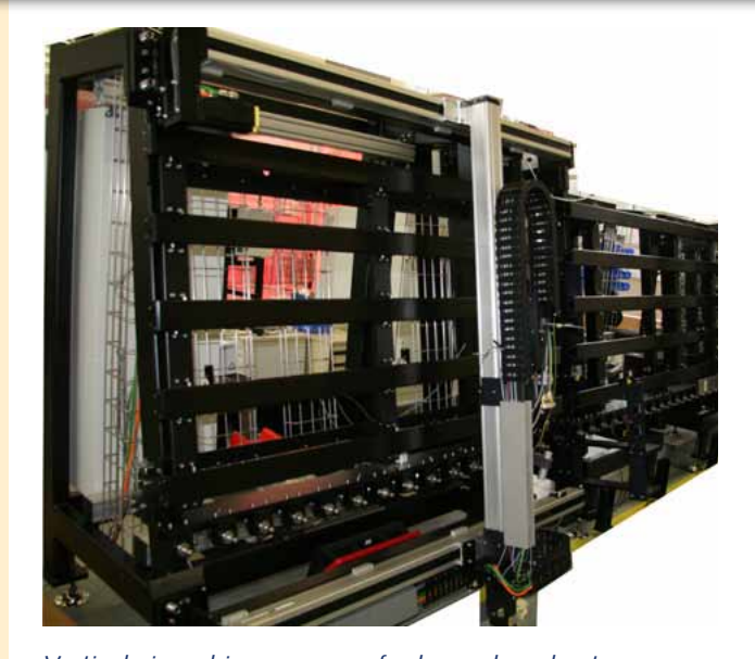
Vertical air cushion conveyor for large glass sheets